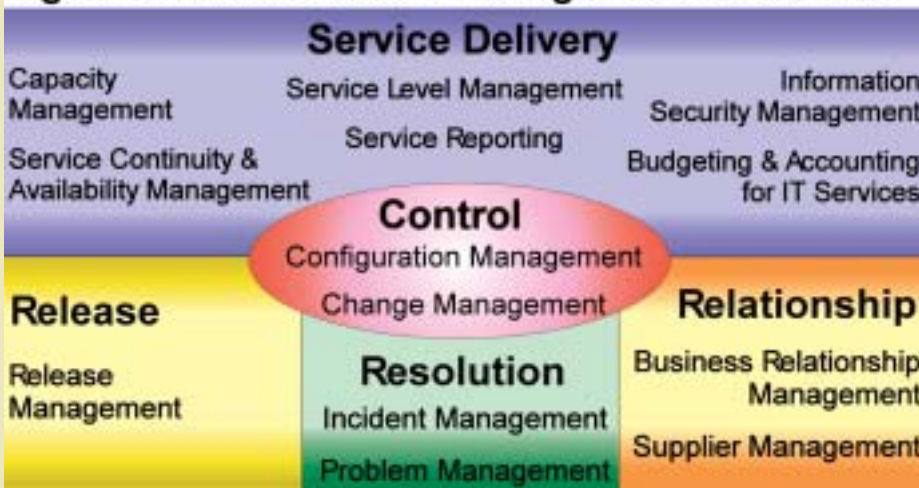
Fig. 1- BS 15000 Service Management Processes